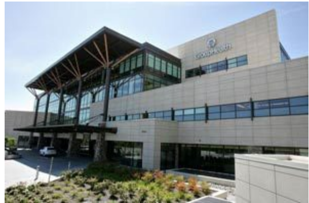
Bellevue Group Health Medical Center

Group Health provides medical coverage and care to nearly 700,000 residents in Washington. Started in 1947 as a community coalition dedicated to making quality health care available and affordable, Group Health continues to be run by a Board of Trustees composed of health-plan members elected by other members. They operate one hospital, 25 primary medical centers, and six additional specialty clinics. Group Health has developed strong partnerships with local educational institutions and community organizations – Seattle Pacific University, Renton Technical/Community College, North Seattle Community College, and SEIU 1199 NW – to address both community and organizational workforce needs. The comprehensive nurse training programs available through Group Health exemplify their commitment to the healthcare workforce and illustrate the benefits of investing in frontline workers. These programs enable incumbent workers to access education and ultimately engage in a career in nursing or health care.